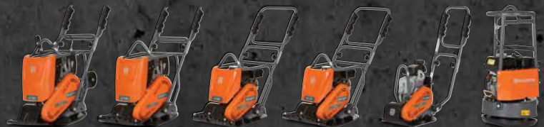
LF 130 LT