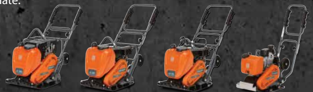
LF 100 LAT